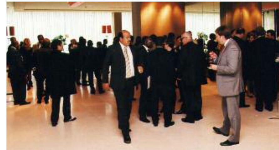
Welcome cocktail offered to all assistants before the lunch celebration.