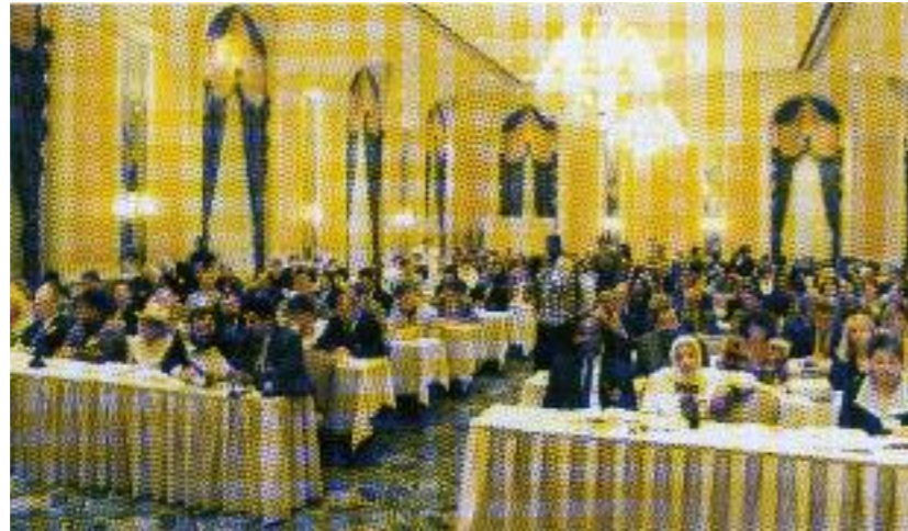
Trade Leaders' Club businessmen meeting.

En mayo de 1979 se fundó en Madrid el Trade Leaders' Club, organización que agrupa a más de 10.000 empresarios y directores de empresa de más de 120 países de los cinco continentes —sin distinciones geográficas o políticas— con el único objeto de fomentar los intercambios comerciales y las relaciones humanas. A través de estos años han sido miles los contactos establecidos entre socios de todos los países, y nuestras oficinas centrales, en Madrid, han colaborado en estas relaciones con su información precisa. Todos los años se celebran reuniones del Club, a las que se invita a participar a todos los socios. El Club cuenta con una completísima biblioteca comercial con información de todos los países, edita un directorio de miembros en formato CD Rom, clasificado por ramos de negocio y países, facilita una tarjeta de identidad a sus asociados e insignia de oro,