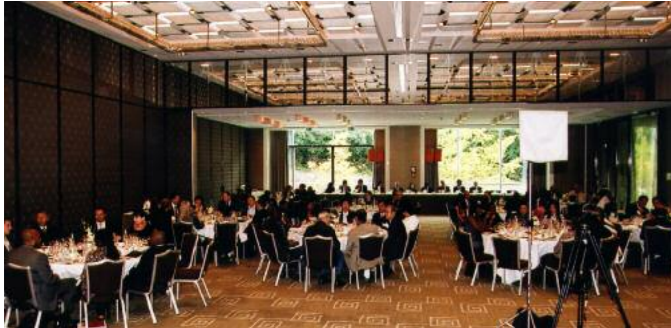
The International Trophy for Quality presentation took place on last 18 th October at the Geneva based Hotel Intercontinental.

On last October 18th, the international Trophy for Quality was given to all awardees in the course of a ceremony that was crown with success at the Geneva based Hotel Intercontinental. The distinction brought together businessmen from all countries and from different industrial branches. Forty companies have been awarded with this prize in this new edition. This Trophy for Quality has been created by Editorial OFICE through the Trade Leaders' Club and is granted to all those enterprises and organisms outstanding due to the quality of their products or services in